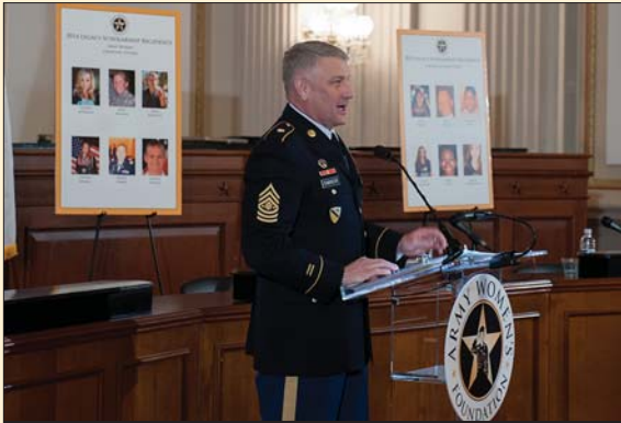
Featured Speaker SMA Raymond F. Chandler III, USA

No matter what jobs our women soldiers hold, or what milestones they achieve, there is a consensus: Our sisters in arms are successful not only because of their individual efforts, but because of the generations of women who served