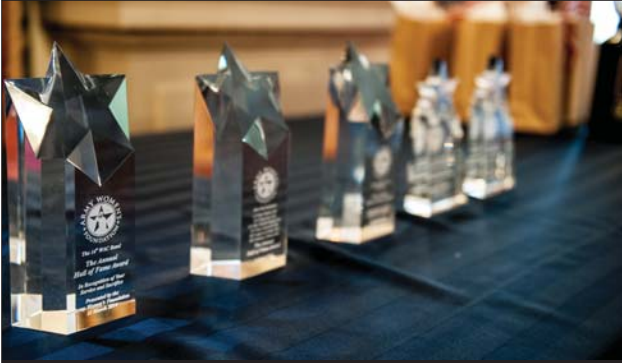
2014 Hall of Fame Awards