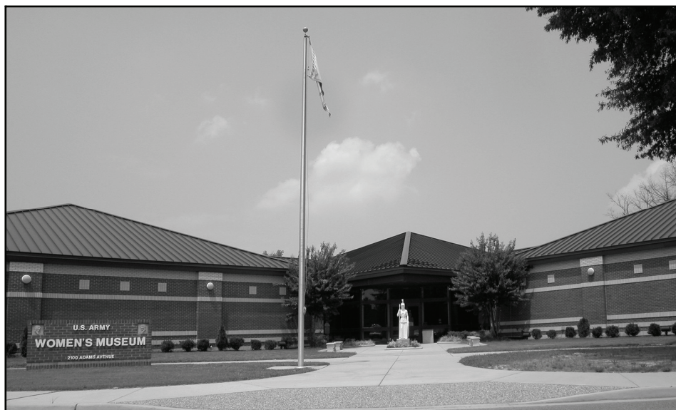
U.S. Army Women's Museum at Fort Lee, Virginia