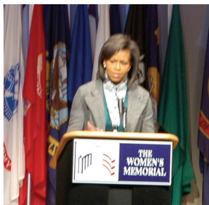
Mrs. Obama speaks at the Women's Memorial

First Lady Michelle Obama opened Women's History Month with a visit to the Women's Memorial at Arlington National