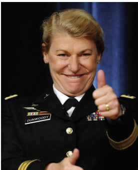
Gen. Dunwoody at her promotion in the Pentagon, Nov. 14 th

I witnessed history in the making when I attended the promotion of Gen. Ann E. Dunwoody last November. It was a thrill to see the first woman promoted to four-star general! Noting the crowded auditorium, Army Chief of Staff Gen. George Casey Jr. remarked that it looked like "everyone but the fire marshal" was there. In her remarks Gen. Dunwoody spoke of the service of her father, grandfather, and great-grandfather, all graduates of the U.S. Military Academy. Her brother is also a West Point graduate; her sister